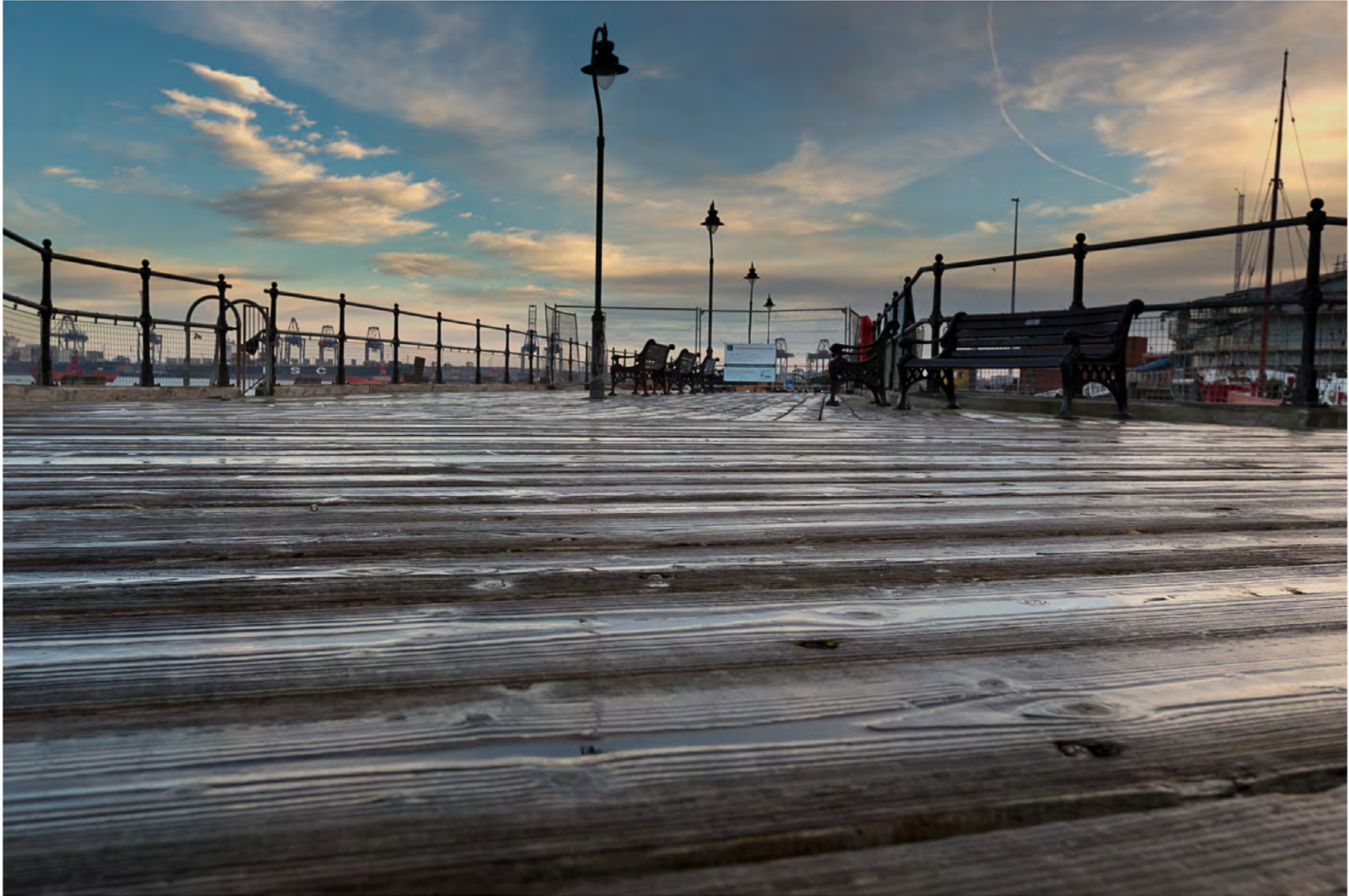
Harwich Pier, November 2017