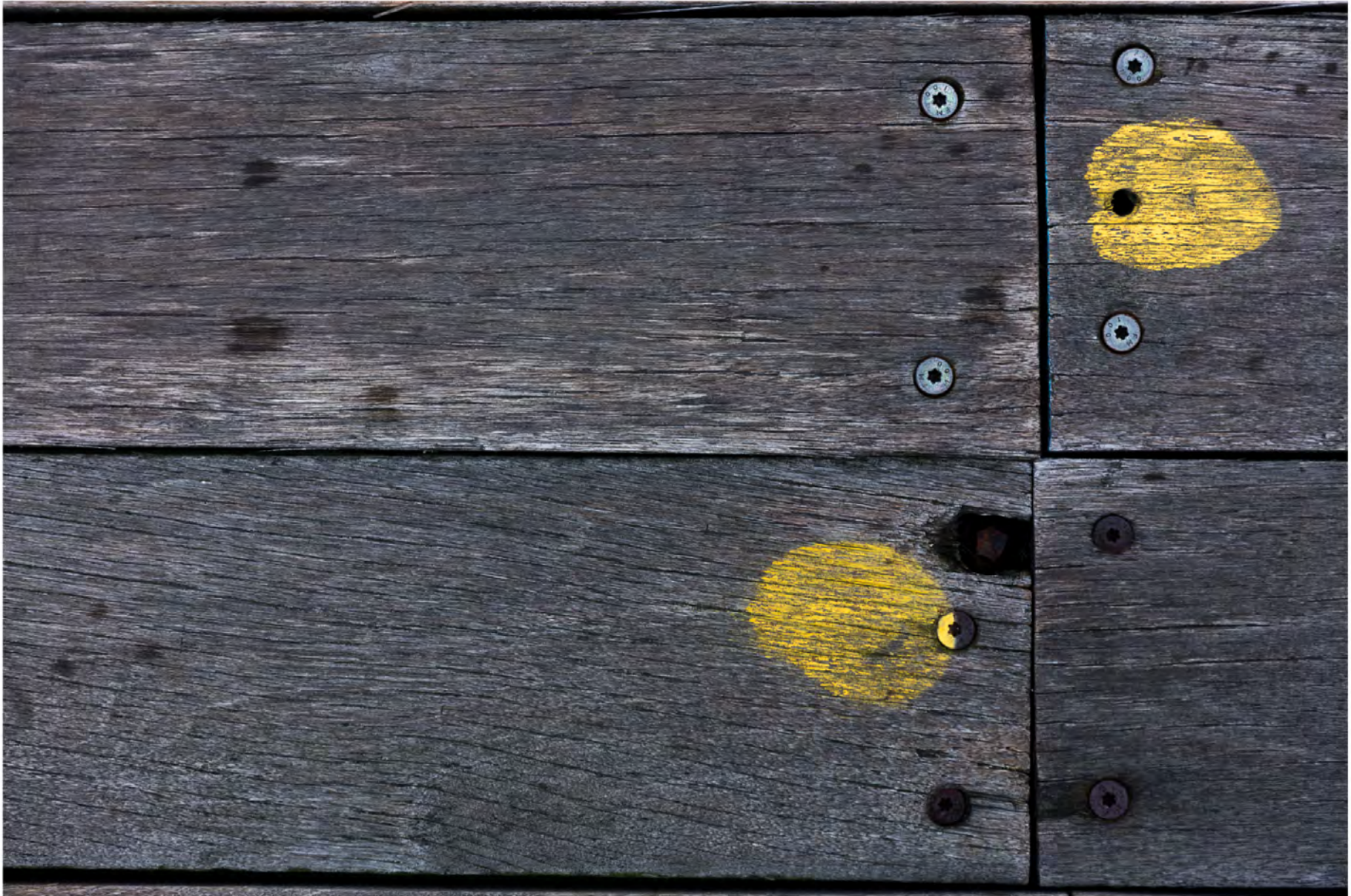
Future Work, Southend-on- Sea Pier, November 2017