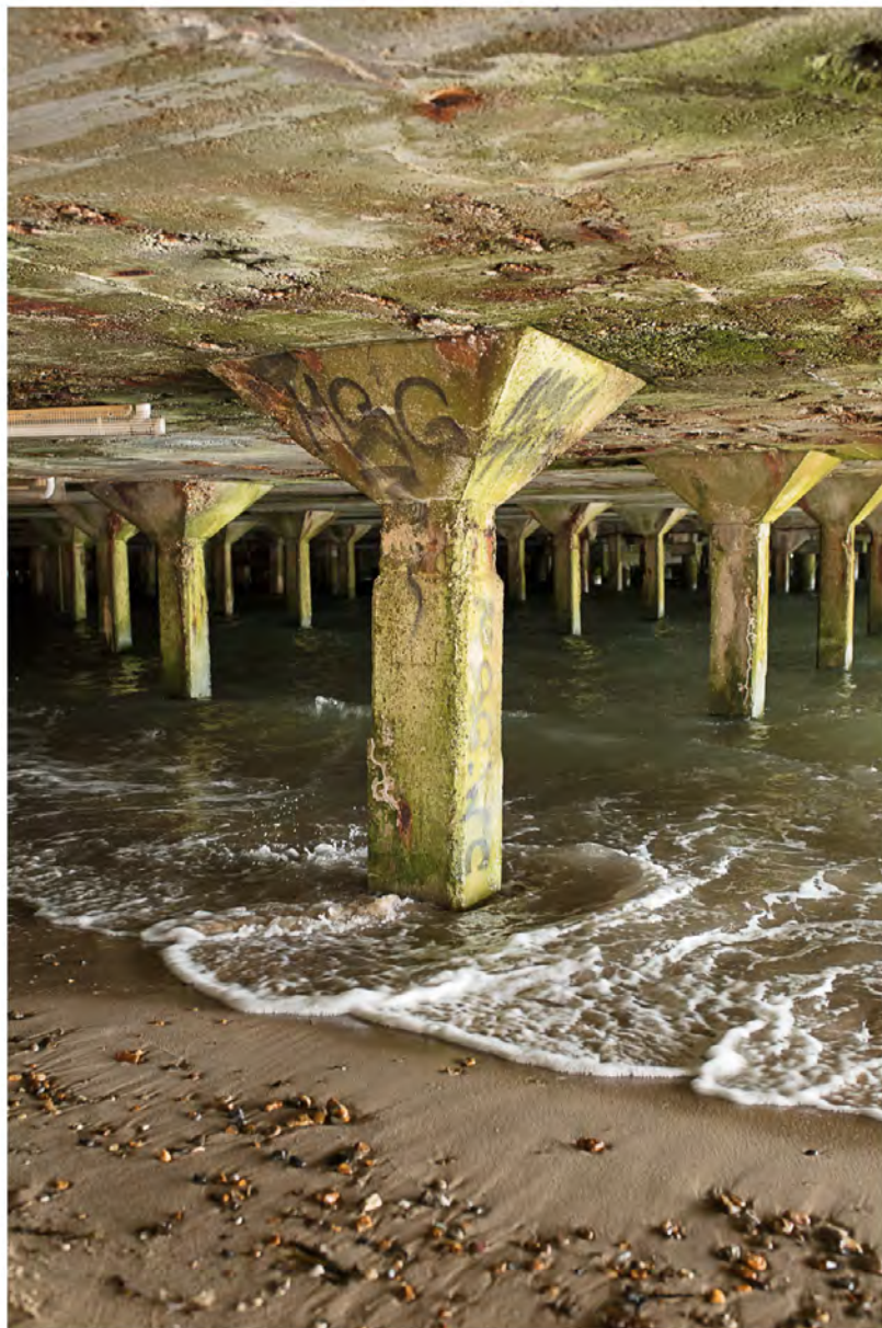
Superstructure, Clacton-on-Sea Pier, September 2017