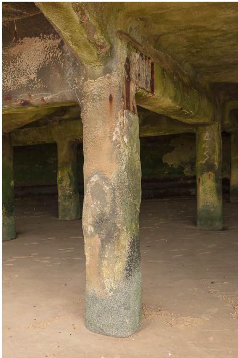
Superstructure, Walton Pier, October 2017