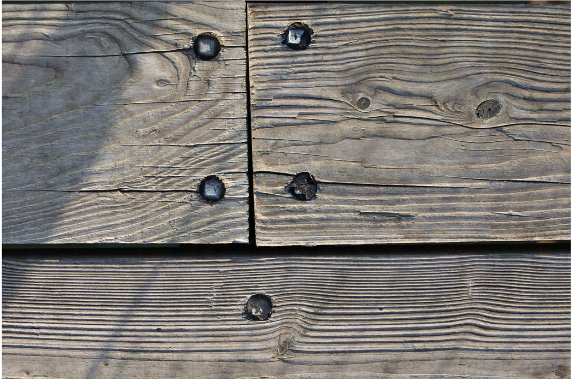
Trace of Sun, Harwich Pier, October 2017