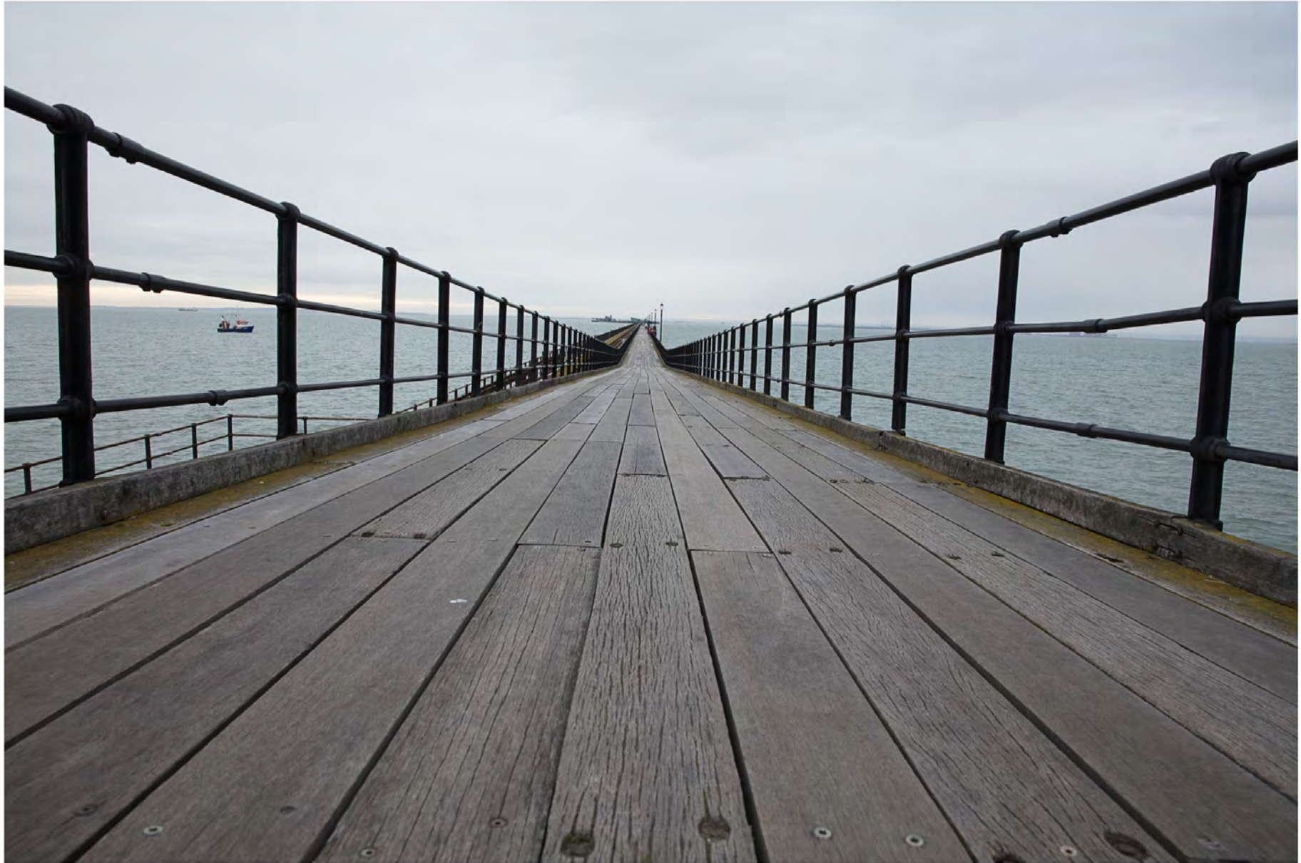
Southend-on-Sea Pier, November 2017