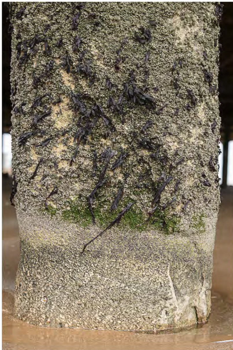
Life on the edge, Walton Pier, October 2017