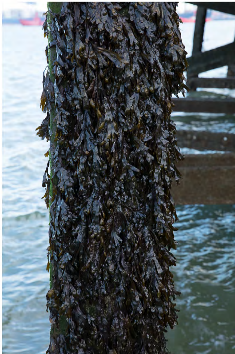
Life on the edge, Harwich Pier, November 2017