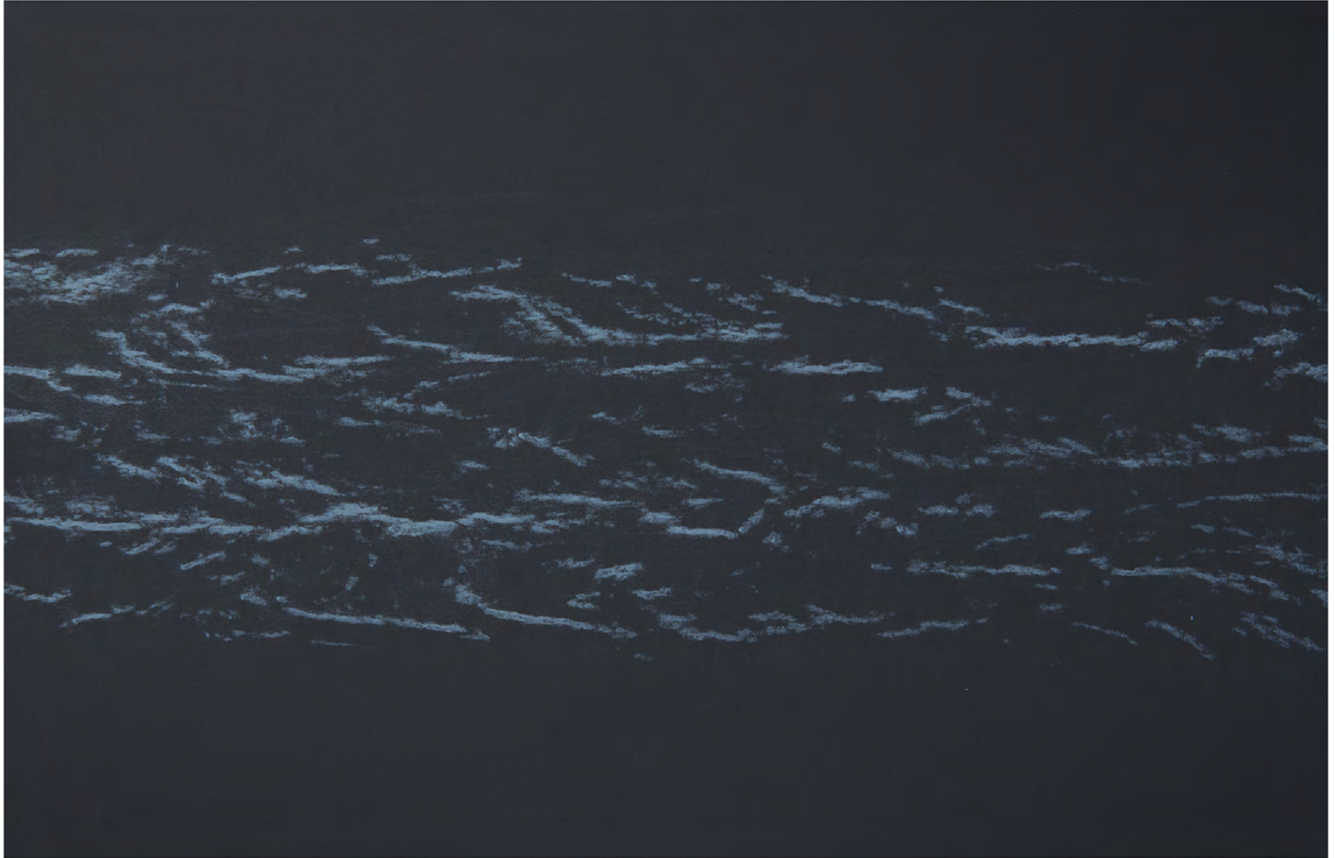
Track Impression, Walton Pier, October 2017