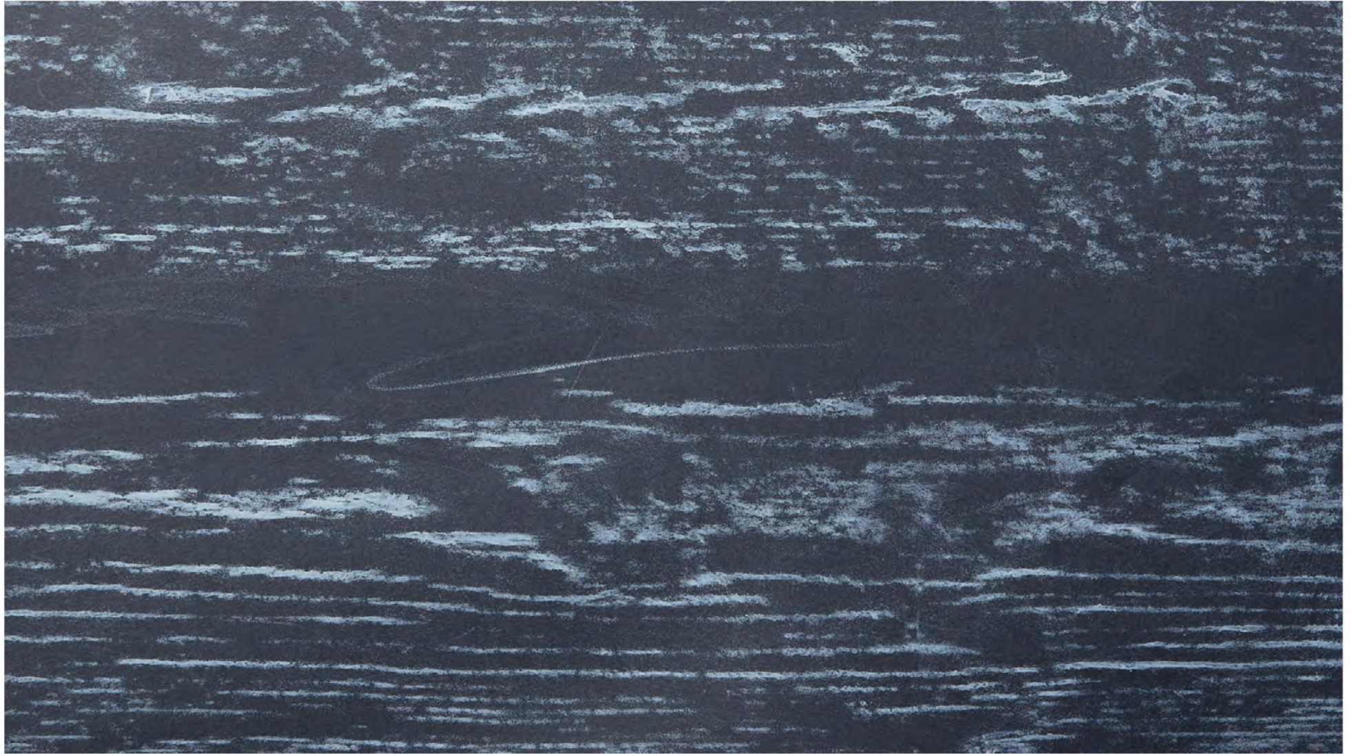
Sea Impression, Clacton-on-Sea Pier, October 2017