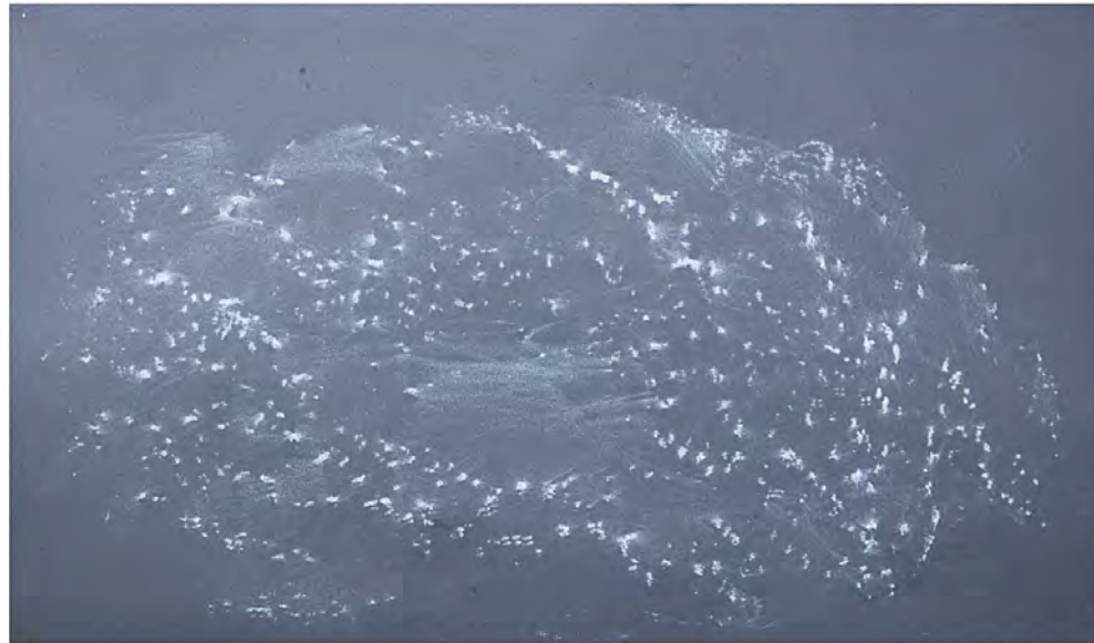
Sealife Impression Diptych, Southend- on-Sea Pier, November 2017