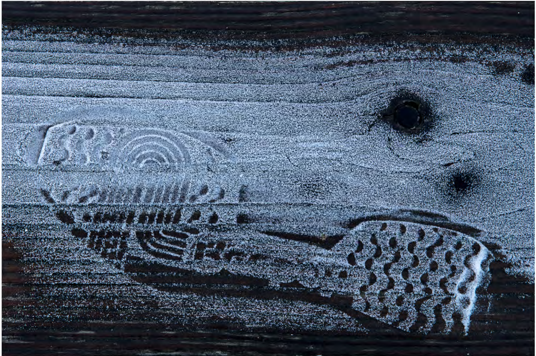
First Step, Harwich Pier, November 2017