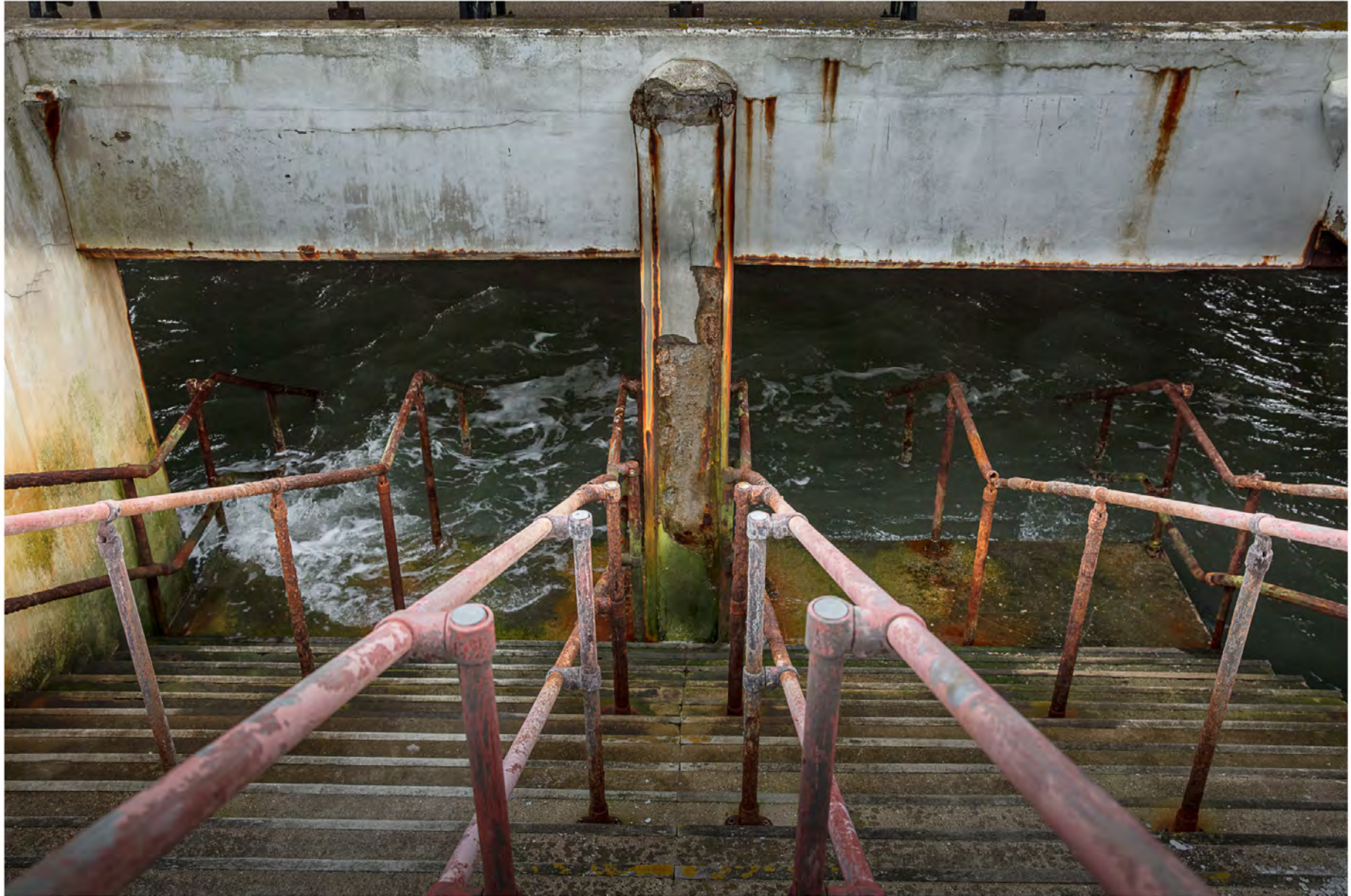
Point of Departure, Southend-on-Sea Pier, November 2017