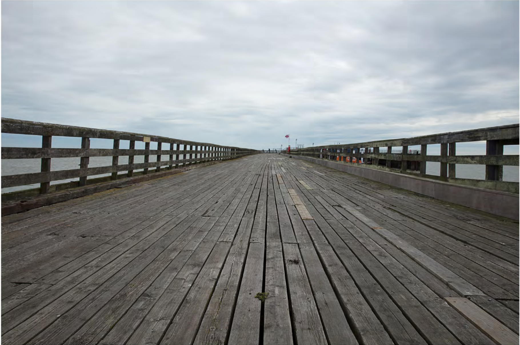
Walton Pier, October 2017