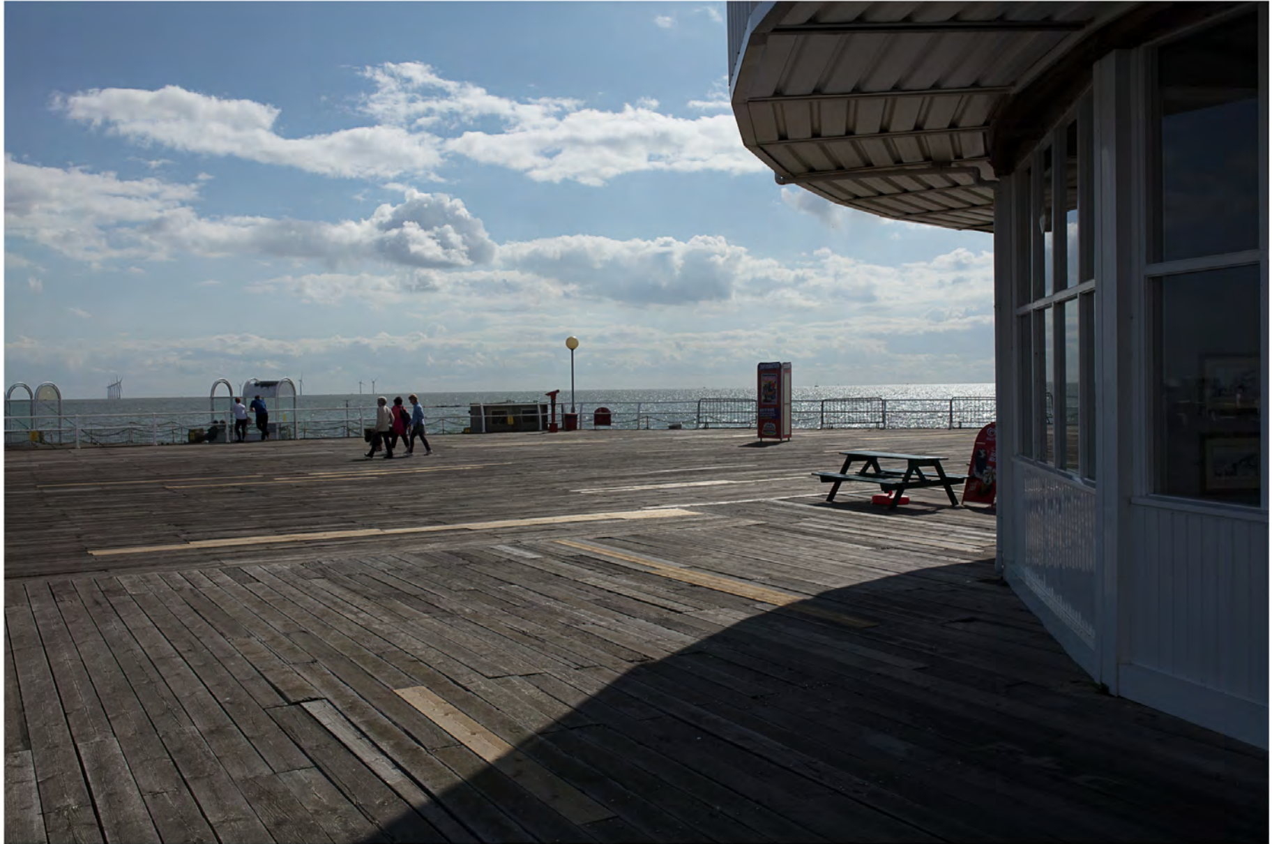
Clacton-on-Sea Pier, September 2017