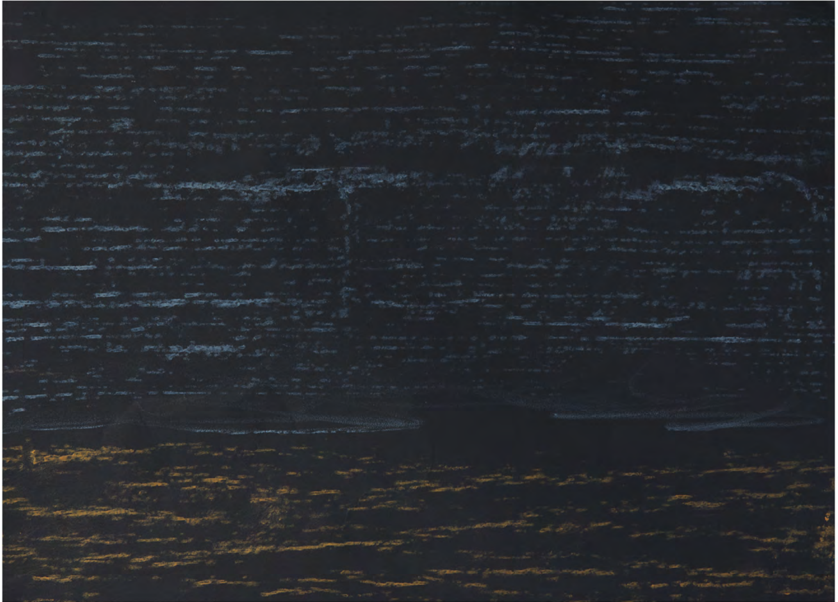
Sea and Beach Impression, Walton Pier, October 2017