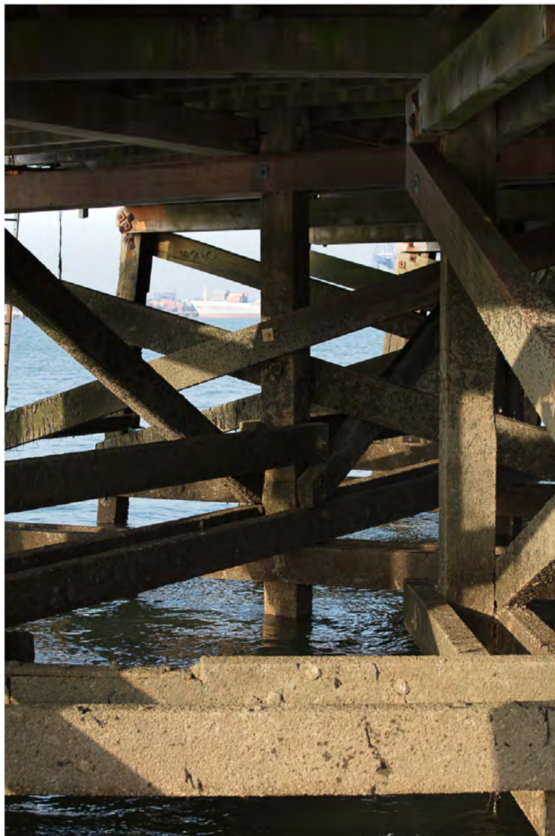
Superstructure, Harwich Pier, October 2017