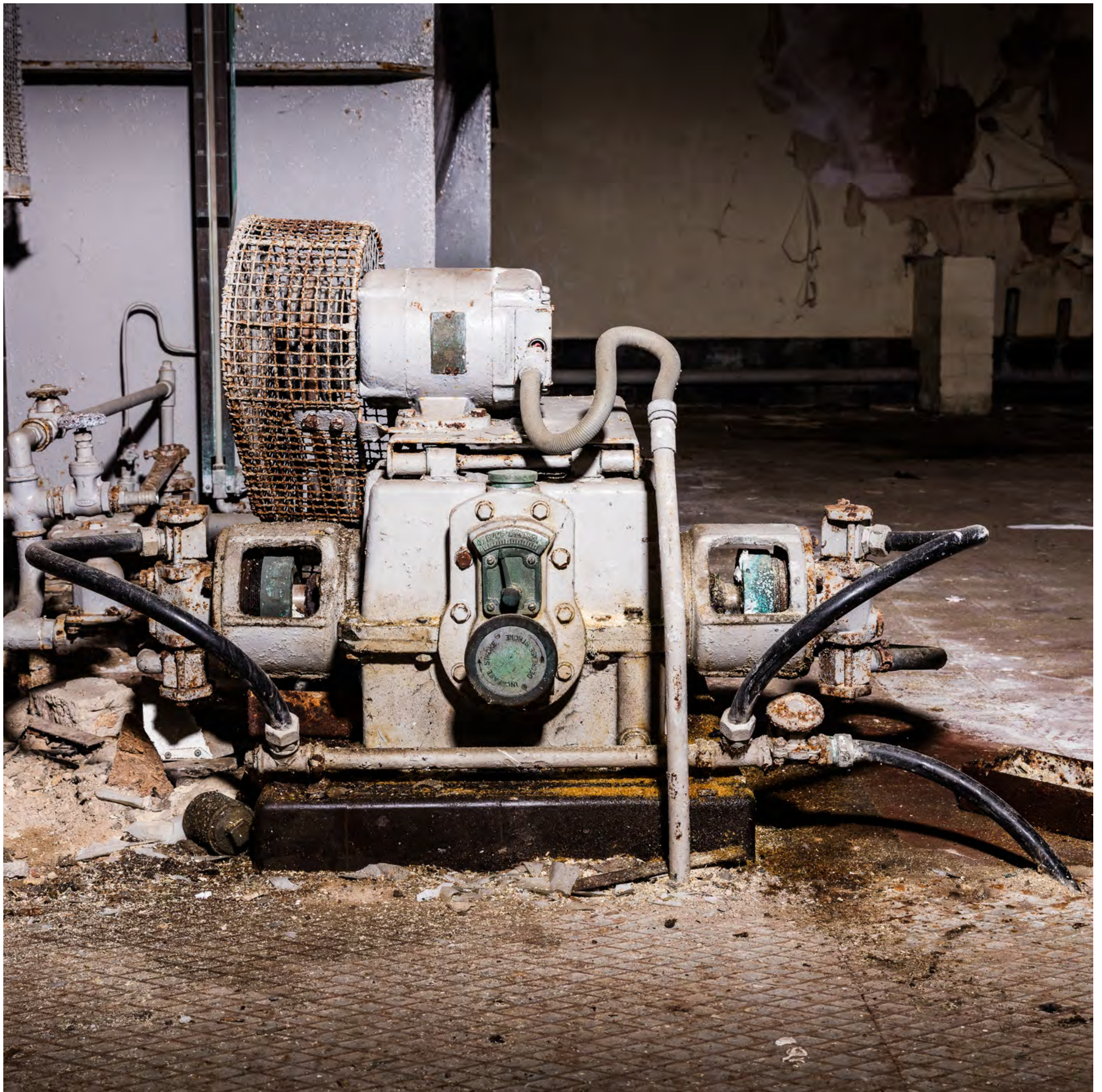
Chemical Mixer Pump, June 2017