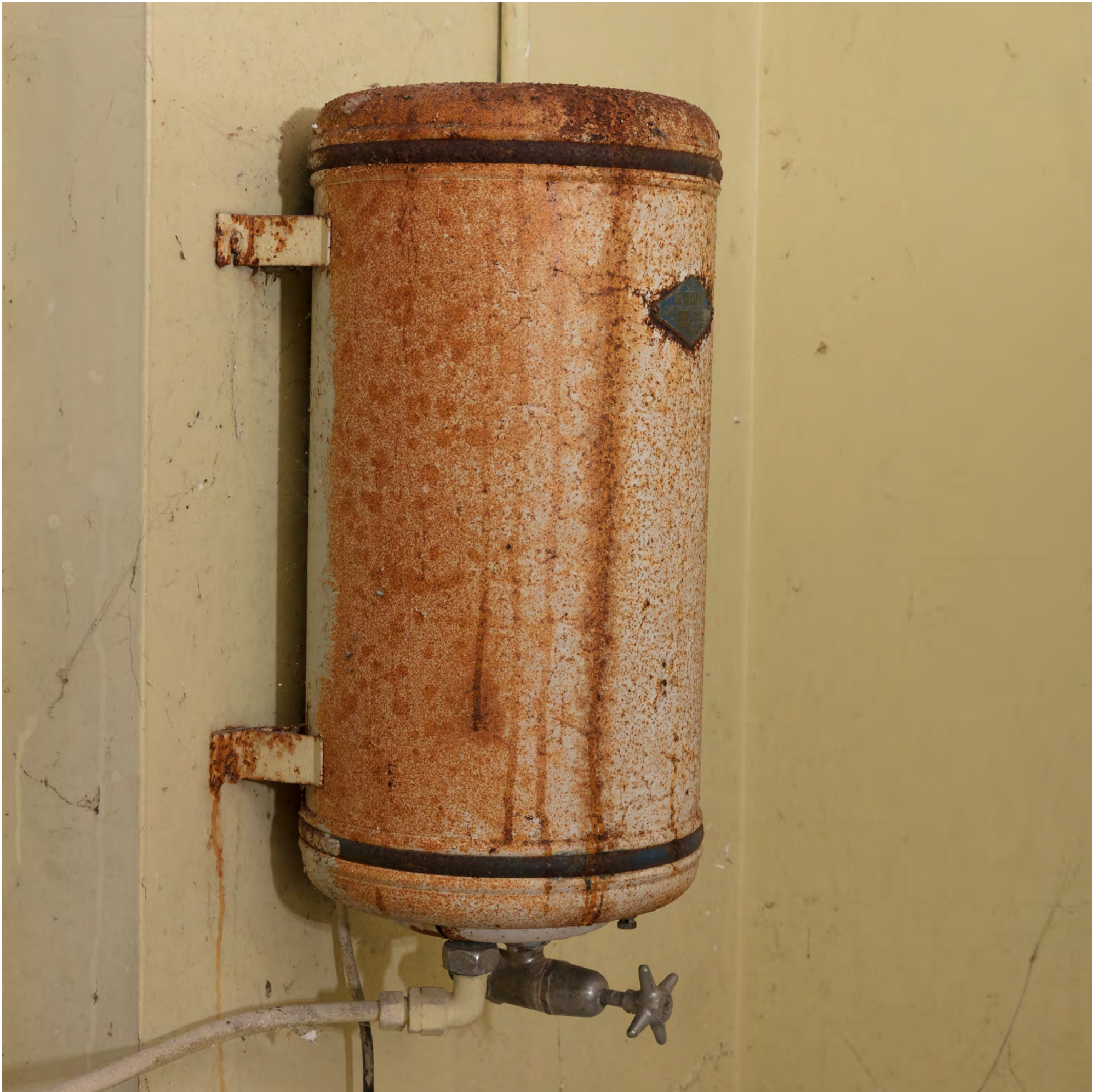
Hot Water Heater, July 2017