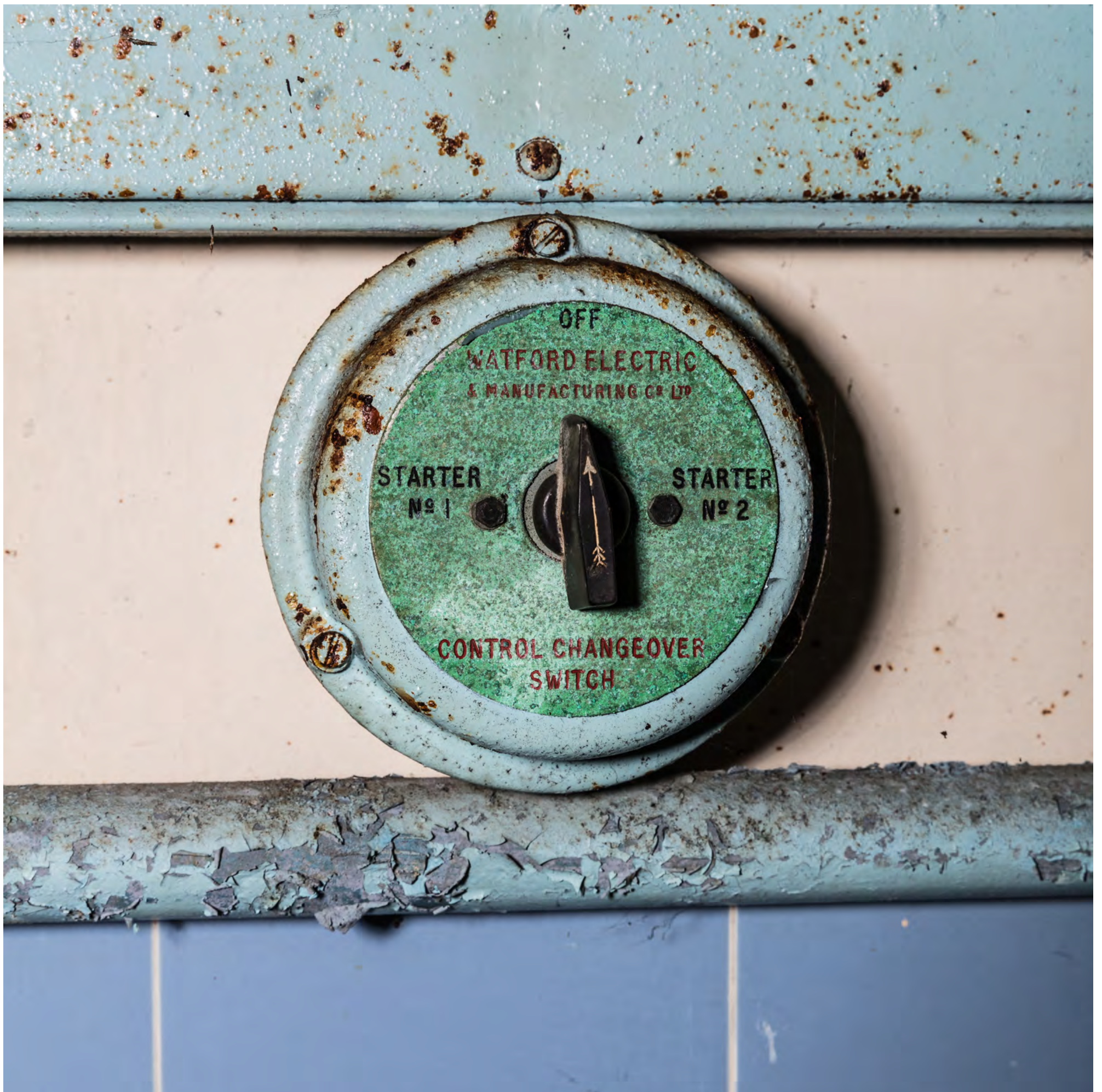
Pump Starter Switch, July 2017