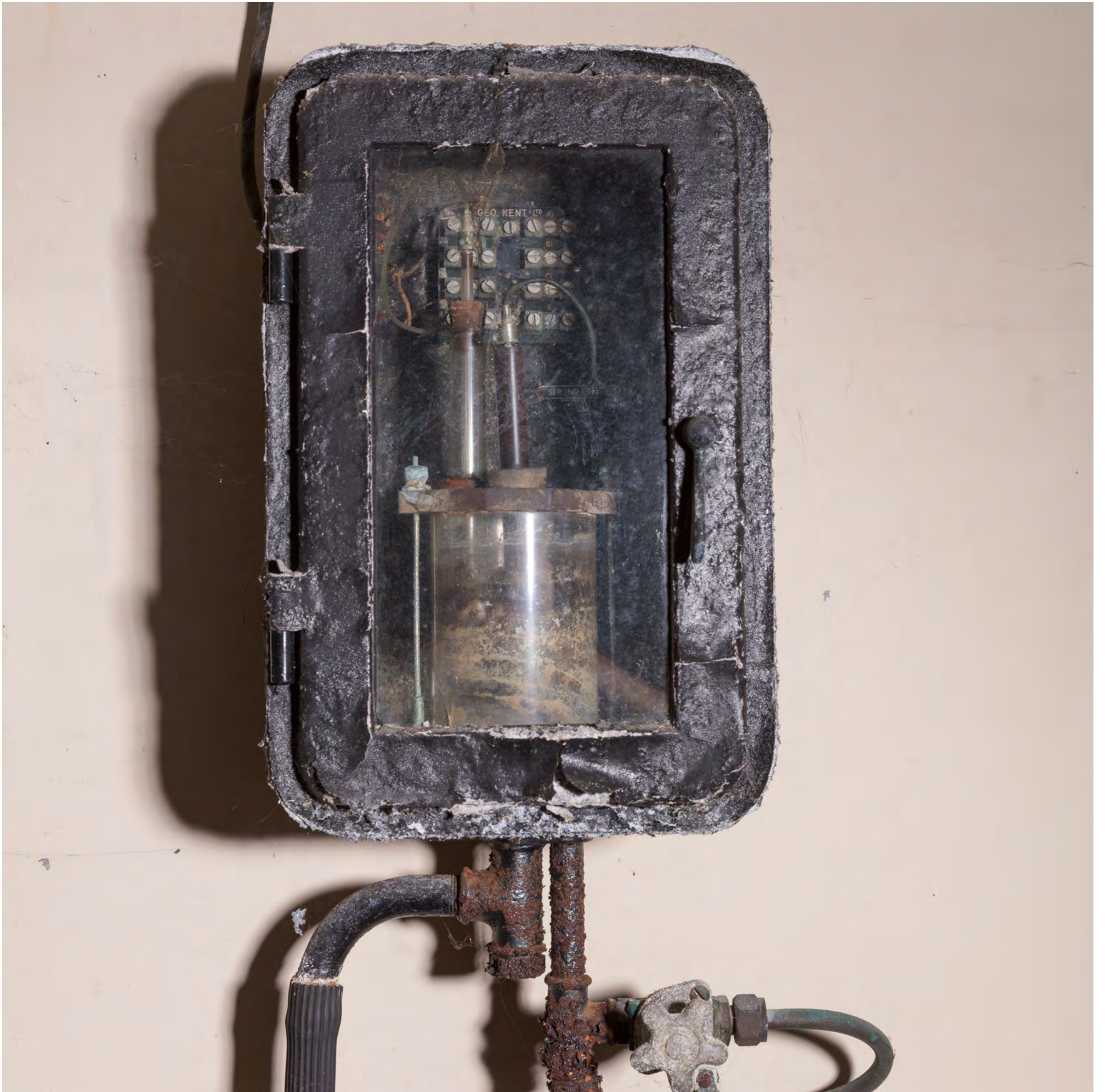
Float Gauge, July 2017