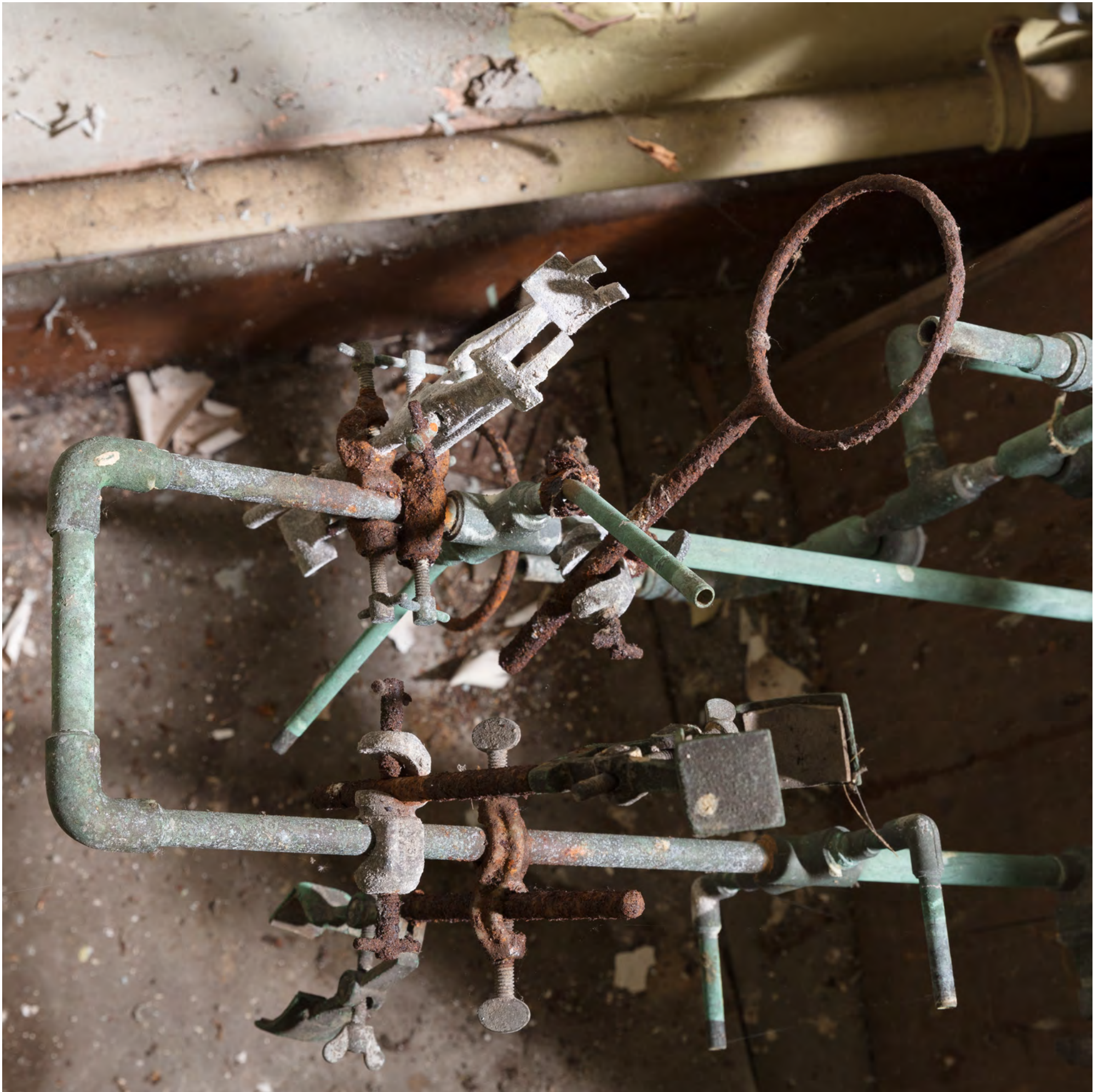
Apparatus, June 2017