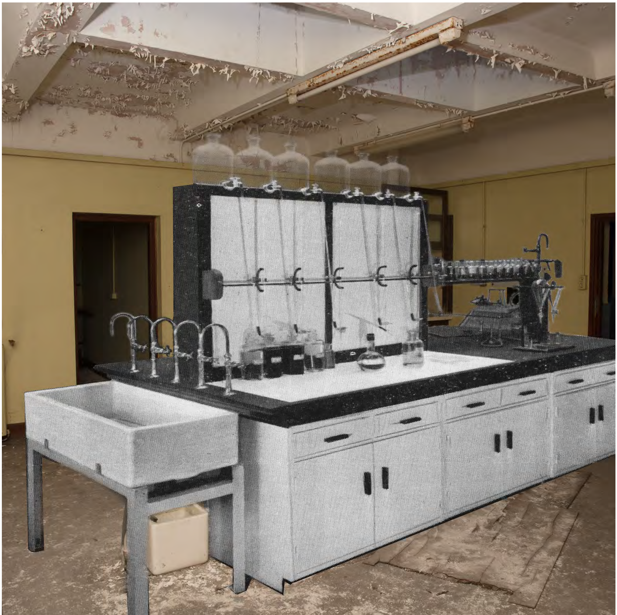
Now and Then Main Laboratory, August 2017