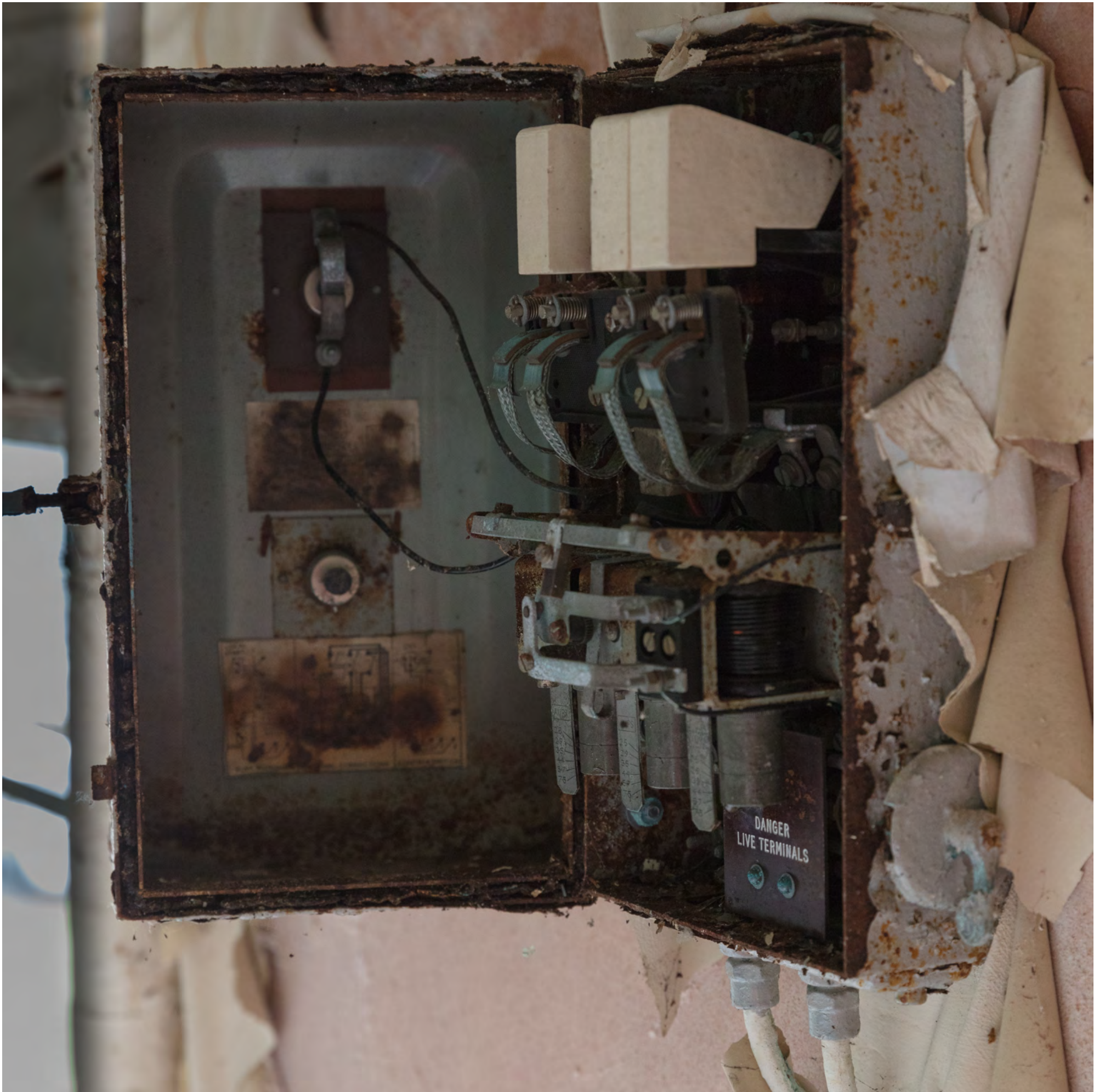
Fusebox, June 2017