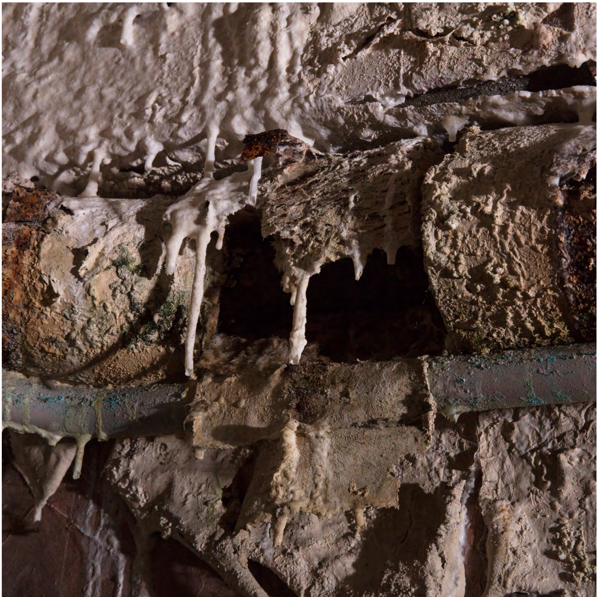
Aluminium Oxidation Stalagmites, July 2017