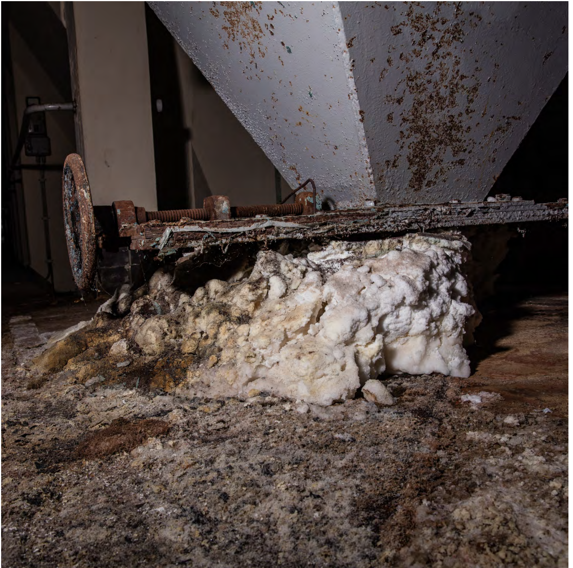
Waste Chemicals, June 2017