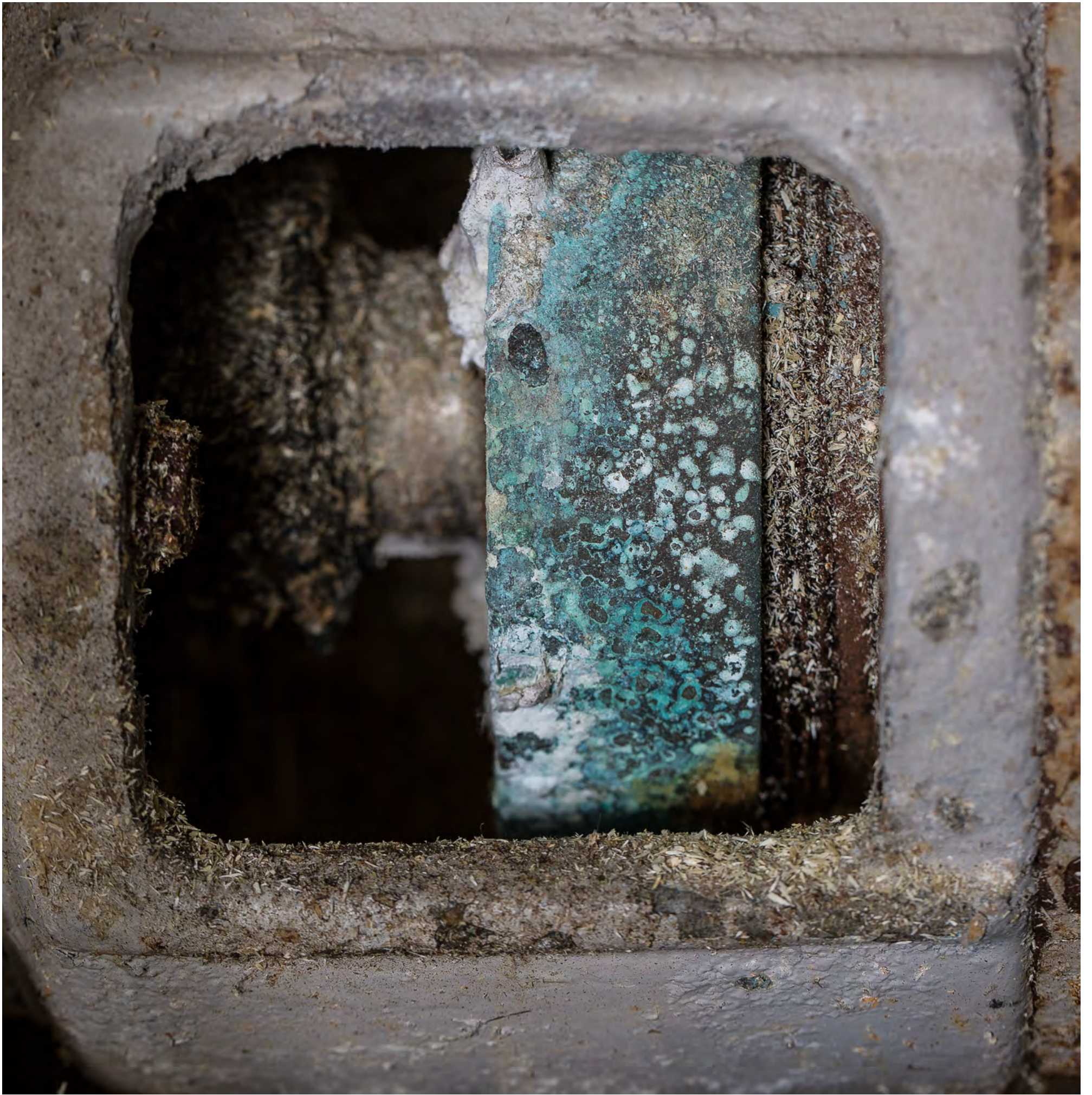
Corroded Flywheel, June 2017