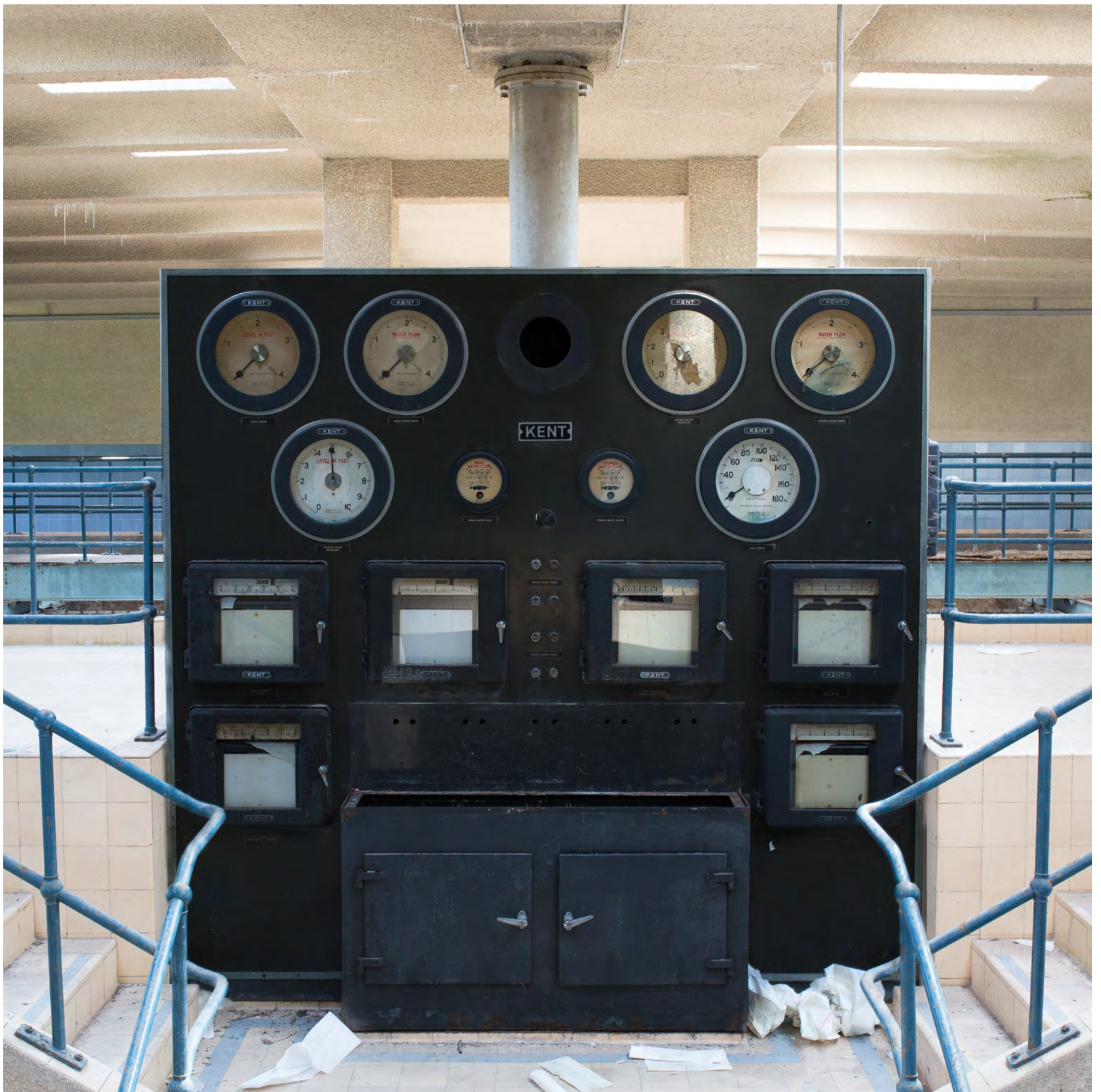
Master Panel, June 2017