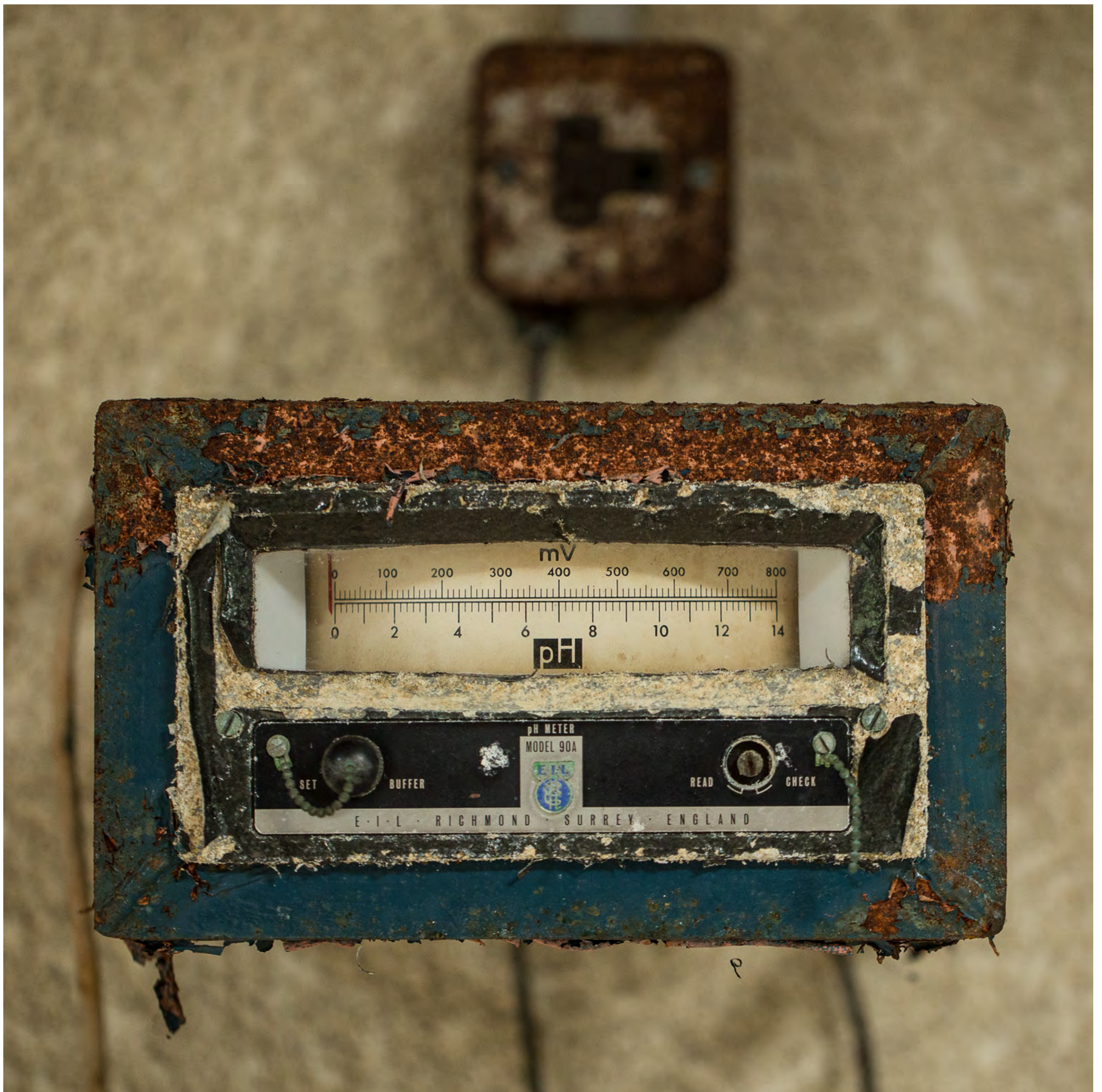
Neutral pH, June 2017