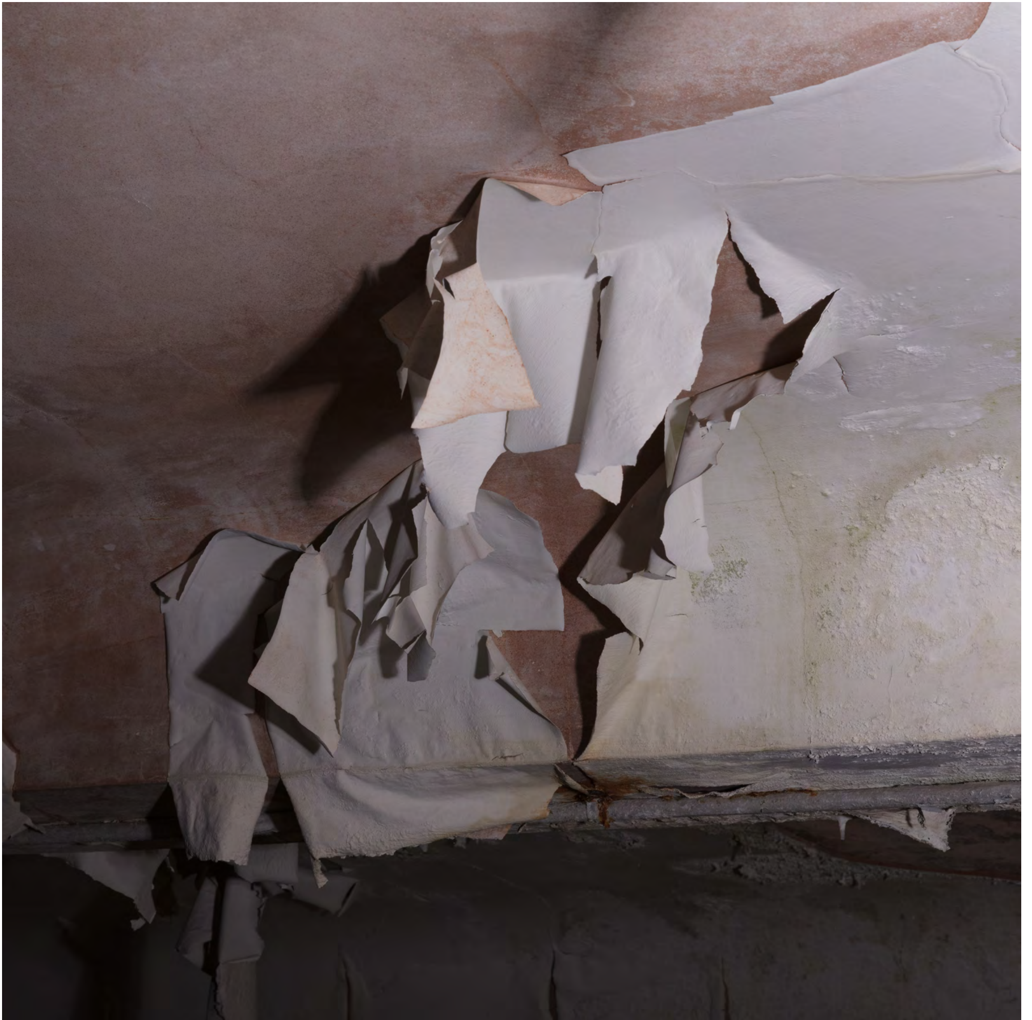
Peeling Paint, June 2017