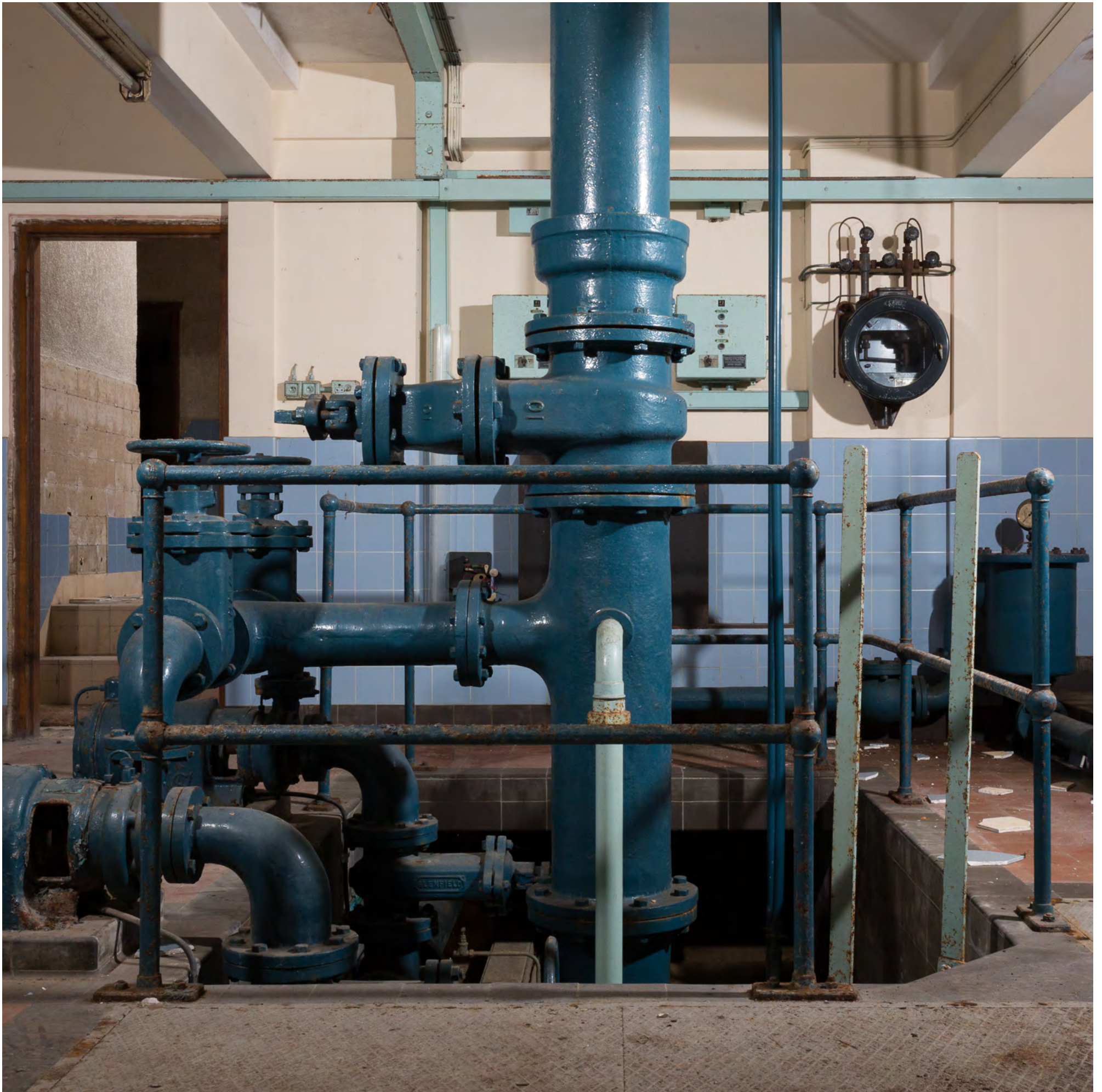
Wash Water Main, June 2017