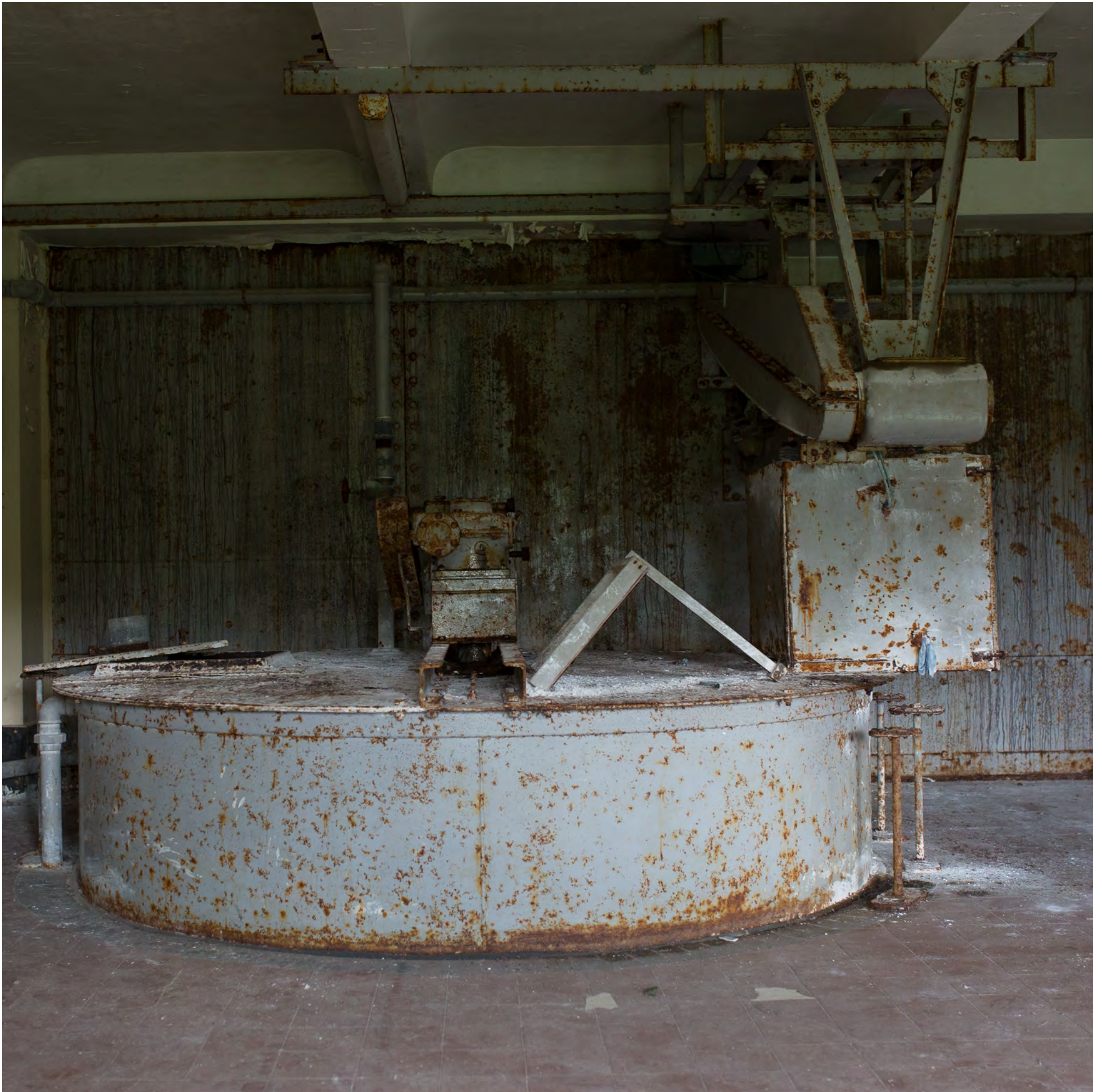
Lime Mixing Tank, June 2017