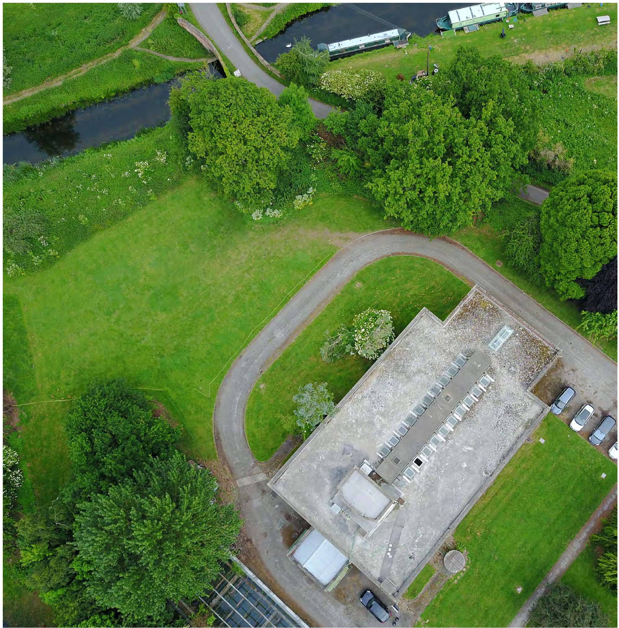
Disconnect at Source, May 2017